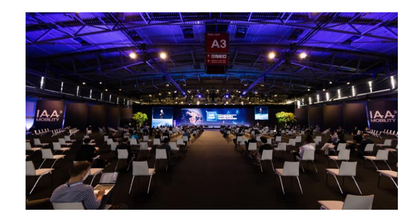
Main Stage (A1)