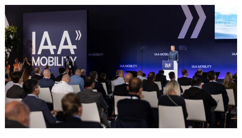
Blue Stage (A3)