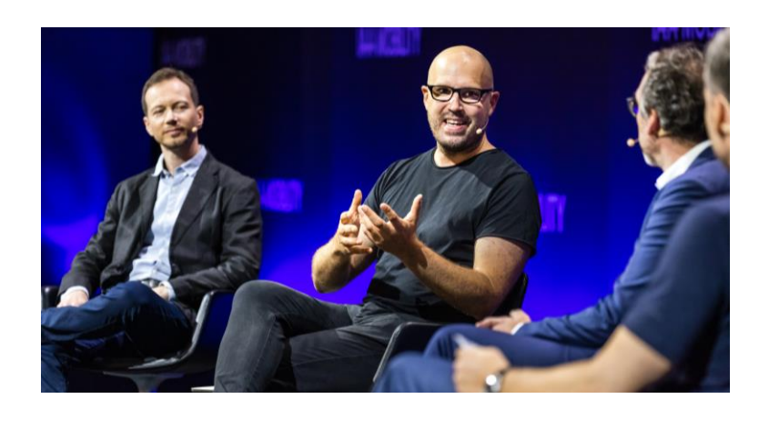
Yellow Stage (B2)